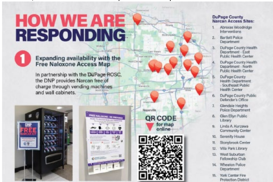
Chart 2: from 2023 DNP Annual Report, https://hopedupage.org/ArchiveCenter/ViewFile/Item/56

overdose from either heroin, fentanyl, a combination of the two drugs or an opioid prescription medication. Several agencies within DuPage County responded to the rising threat of opioid deaths. The DuPage County Health Department collaborated with the Coroner, Sheriff, State's Attorney, and Chiefs of Police to create the DuPage Narcan Program (now part of HOPEDuPage, https://hopedupage.org/ ) which put the life-saving opioid reversal drug, naloxone, into the hands of first responders and anyone who can access one of the following sites: