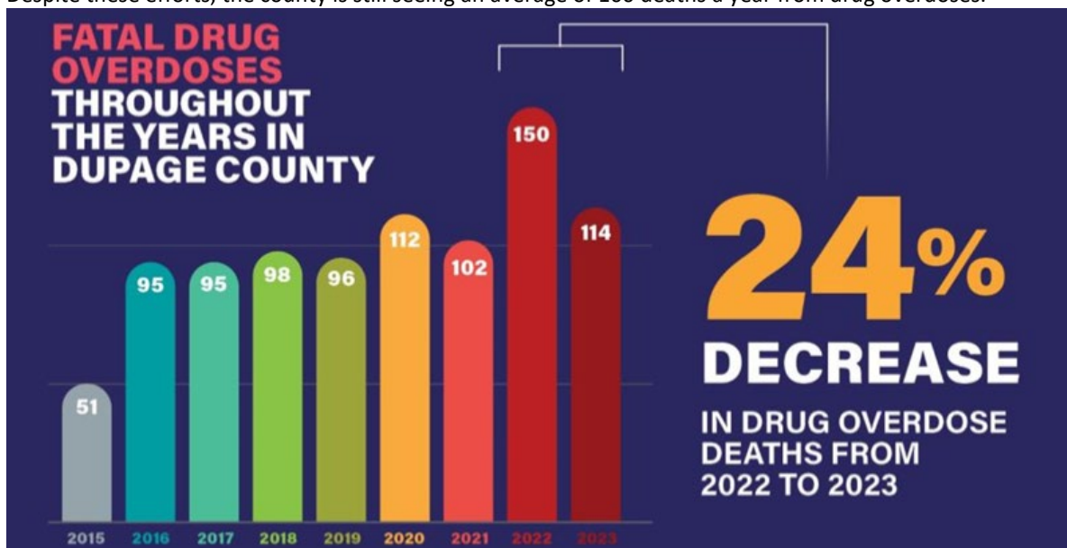
Chart 3: DuPage fatal drug overdoses from https://hopedupage.org/189/Data

Despite these efforts, the county is still seeing an average of 100 deaths a year from drug overdoses.