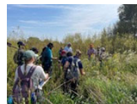
Wetland scientists gather to learn specific plants that mark the presence of a wetland.