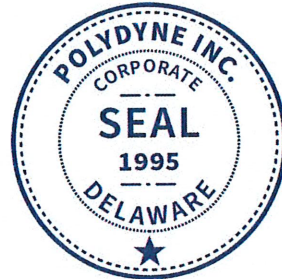
CORPORATE SEAL (If available)

BID MUST BE SIGNED AND NOTARIZED (WITH SEAL) FOR CONSIDERATION