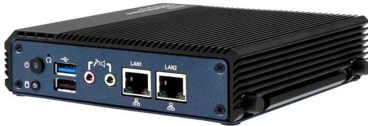
Figure 1-1: Dynamic Conventional Gateway 9000

The DCG 9000 supports DFSI for either Digital (P25 CAI) or Analog (FM) stations, but not Mixed mode channels. It does support mixing DFSI and ASTRO 25 channels on the same physical DCG 9000 but a control room firewall is still required to be between the switch and the DFSI stations and it is limited to placement on at the site types described in the previous paragraph. DFSI is not currently provided on a comparator based channel. Packet Data is not supported on DFSI enabled channels.