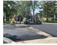
Crews pave over the final stretch of the Country Club Highlands project.

larger project adding more stormwater capacity to the community. Construction is currently estimated to begin in the spring of 2024.