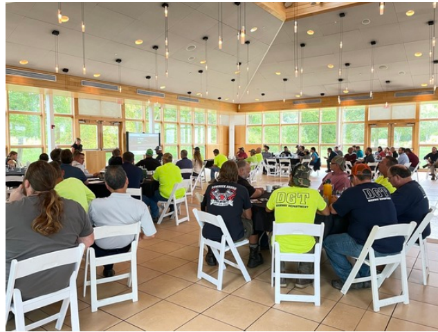
Municipal staff listen to a presentation on green infrastructure design resources at Danada House in Wheaton.

In early September, SWM hosted the annual Green Infrastructure Seminar for MS4 Communities. For the first time since 2019, municipal engineers, field crews and consultants gathered at Danada House to hear presentations on Illinois Groundwork, an exciting new GI design resource, the successes of the Downers Grove Bioswale Program, and tips for maintaining permeable pavers from Morton Arboretum.