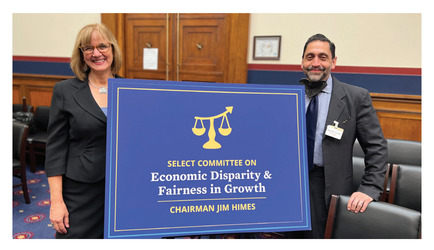
Miami-Dade County, Fla. Commissioner Eileen Higgins testifies before the U.S. House Select Committee on Economic Disparity and Fairness in Growth regarding utilizing infrastructure dollars to promote workforce opportunities and long-term prosperity.