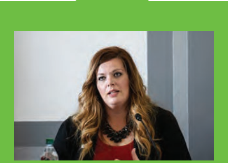
The chairman of our subcommittee let us know about available funding. I applied and received a grant to set up a curbside voting project. If not a member, we wouldn't have received the grants.

From conferences to committees to video calls and meetings, there are many opportunities to meet and connect with new people dealing with similar issues that you're facing. And it isn't all business. Important friendships are made too!