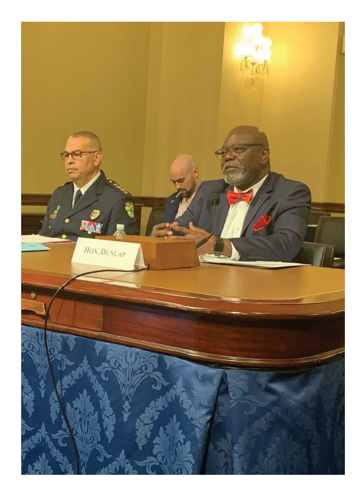
Mecklenburg County, N.C. Commissioner George Dunlap testifies before the House Homeland Security Committee's Subcommittee on Emergency Preparedness, Response and Recovery on the county role in supporting resiliency and disaster preparedness.

In 2022, the nation experienced 18 separate billion-dollar disasters which totaled approximately $165 billion in damages