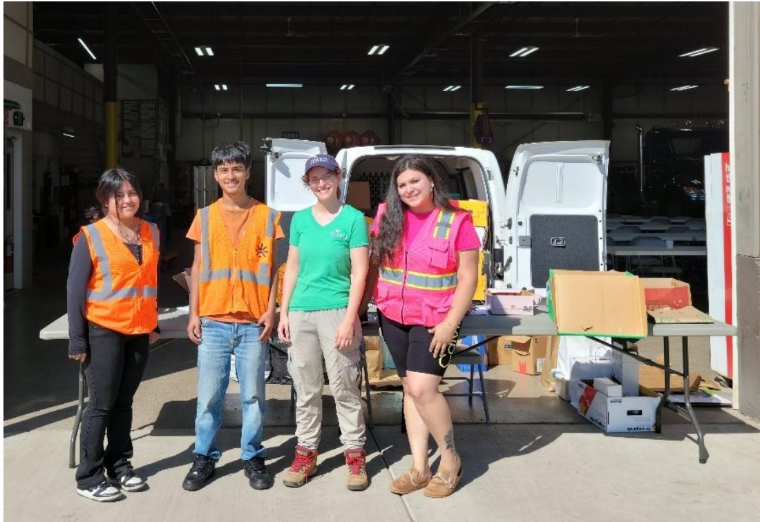
Volunteers from Selvin's Landscaping in Addison and West Chicago