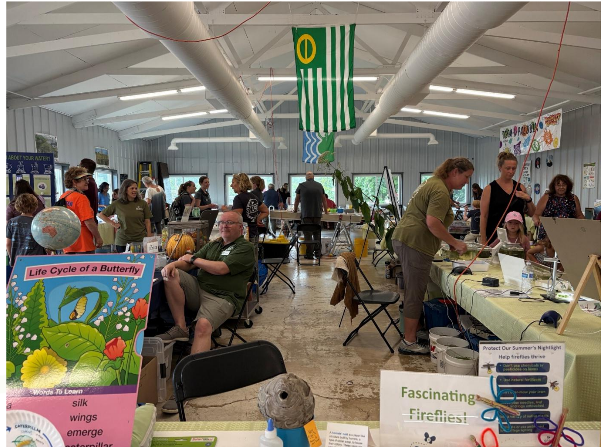
STEM-A-PALOOZA 2025, 28 different stations!

Programs for schools, churches, businesses, park districts, libraries, and garden & civic clubs