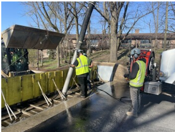
SWM Maintenance Crew members clean a flood gate in Hinsdale to ensure operation during an emergency event.

Through the Department's Shared Services program, the Stormwater Maintenance Crew worked in Hinsdale last