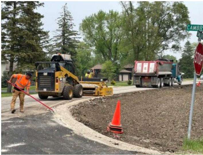
Crews place stone shoulder along Smith Road, one of the final tasks needed to consider the project substantially complete.

The final tasks needed to reach substantial completion on the Smith & Cambridge Drainage Improvement Project were finished this week. The project, located in unincorporated West Chicago, is one of many SWM has funded through our allotment of the DuPage County ARPA funds. It provides upgraded storm sewers and stormwater detention to reduce flooding. Restoration work, including sodding, is expected to be completed over the next month.